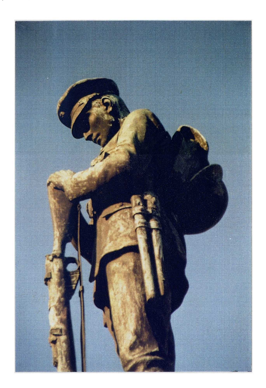
Newmains War Memorial (detail).