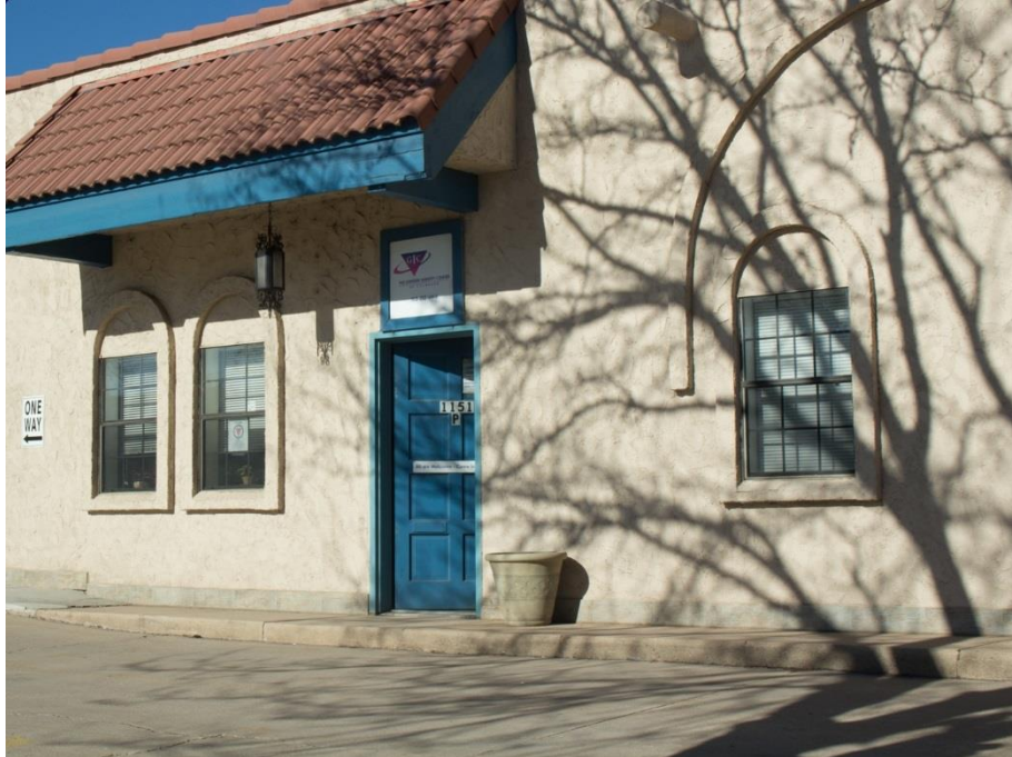
Illustration 1-1: Photograph, ‘Gender Identity Center of Colorado’, 2016 18

When my thesis journey began, I undertook a social work PhD, influenced mainly by my previous training and my belief in the importance of oral history as a research methodology. I knew I wanted to use mostly unstructured life history interviews, because of the freedom they afforded me of moving backward and forward in the narratives, increasing the comfort of narrators, and enhancing the quality of information and authority shared.