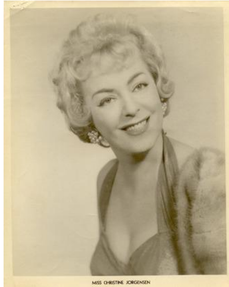
Illustration 0-1: Photograph, ‘Miss Christine Jorgensen’, Headshot of Christine Jorgensen with her talent agency’s information on the reverse, Christine Jorgensen Collection (Circa 1960) 12

developed, established and cemented historically into both medical literature and popular culture.