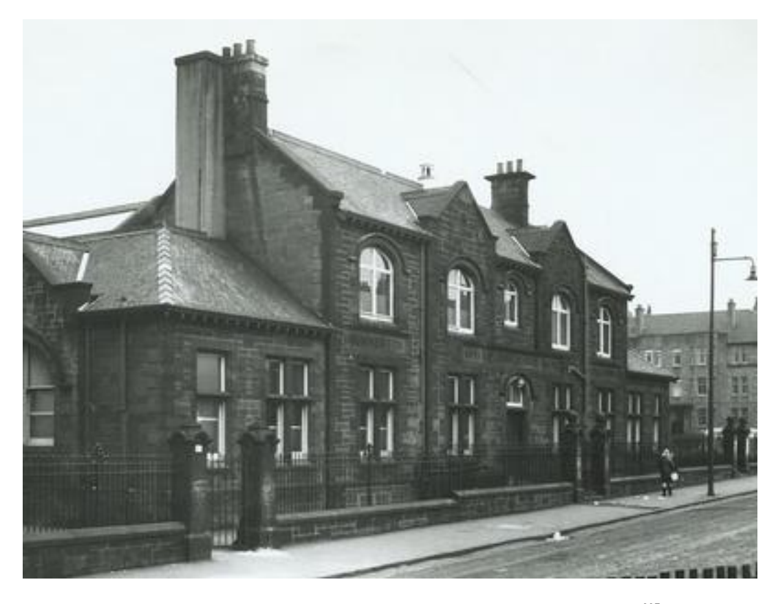
Summerton School for Physically and Mentally Handicapped Children, Ibrox, 1970s<sup>997</sup>.

special schools Scottish, estimated in 1974 to be approximately 8,000 and 10,000 pupils (example of Summerton Special Needs School pictured below). 996