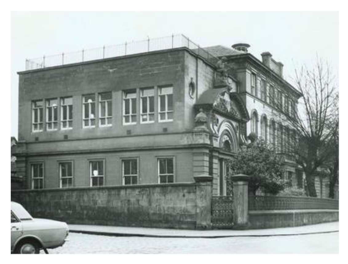
St Aidens School, Glasgow, 1970s<sup>976</sup>

was stated 'the picture was depressing, one of impoverished homes...the stamp of failure on them'. 974 Further articles in the collection of the Scottish Council for Educational Technology papers, specifically on the implementation of 'The Kerr Family' in St. Aidens School (pictured below) also stated that 'many of these children come from less well-off families, often with a tradition of unemployment and consequently housing conditions tend to be poor'. 975