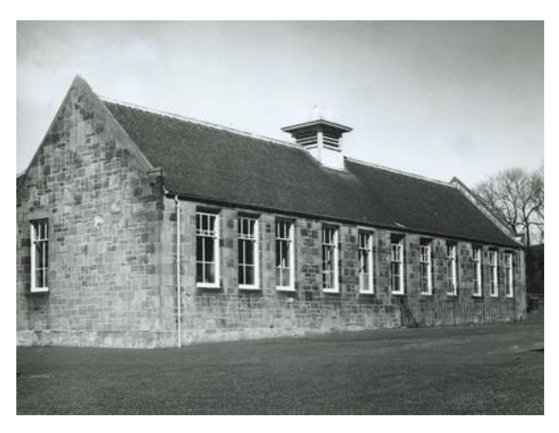
Drumchapel School in 1970s which became the TFWC in the late 1980s. http://www.theglasgowstory.com/imageview.php?inum=TGSA02508

Oral testimony also suggests the impact of 'community attitudes' which could be a major barrier in the aims of promoting 'normal' patterns of life and 'integration' in day centres. For example one participant explained, 'there wasn't a lot of community participation, people were probably hoping that we would move out because it was within the village of Drumchapel and a prime site that we were holding that now has beautiful luxury flats in it...people round about the building then...kind of thought...we've got lunatics on our doorstep which brings the prices of our houses down and therefore we didn't feel kinda welcome or feel comfortable'. 1250