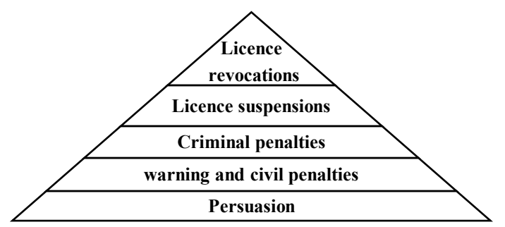
Figure (1) The Enforcement Pyramid*