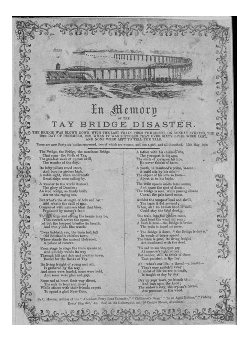
Figure 2, 'In Memory of the Tay Bridge Disaster,' printed by C. R. Horne, Aberdeen.

National Library of Scotland, <u>https://digital.nls.uk/broadsides/view/?id=16622</u>. Reproduced with permission of National Library of Scotland under Creative Commons Licence CC-BY 4.0.